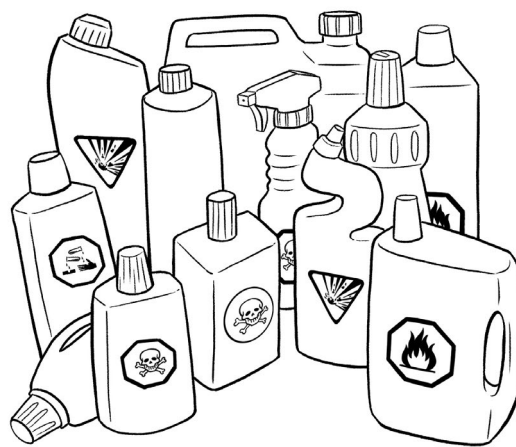
ᐱᐱᓕᓂᓐᓴᓂᓐ ᓕᐃᓂ ᐱᓕᓕᓂᓐ