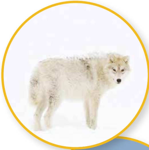
בִּזְרֵי שֶׁבַע קִלְפֵי בִּזְכֵי