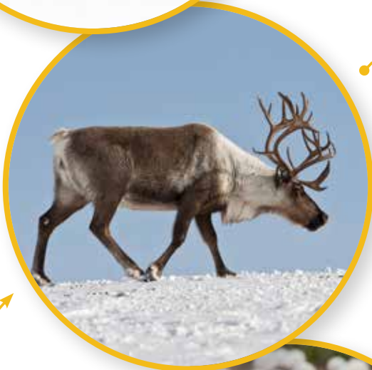
בִּזְרֵי שֶׁבַע כֵּכָה > אֶלְדֵי אֶלְדֵי