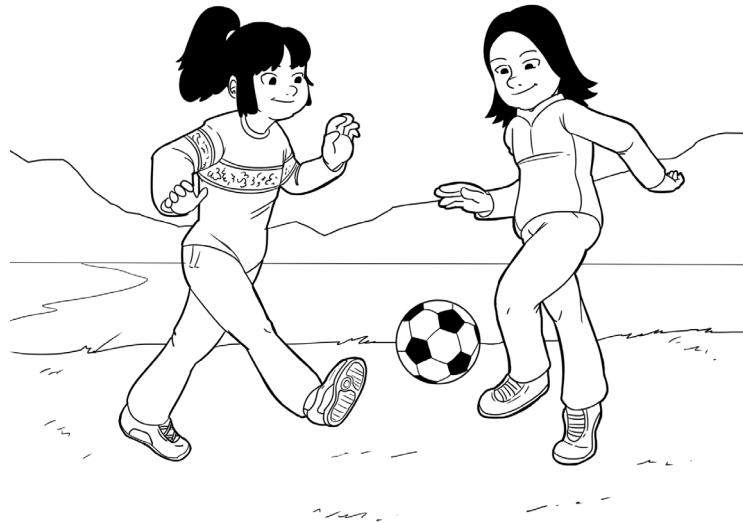
ᐱᐱᑦᑲᑦᑲᑦ ᑲᑦ ᐱᑦᑲᑦᑲᑦ