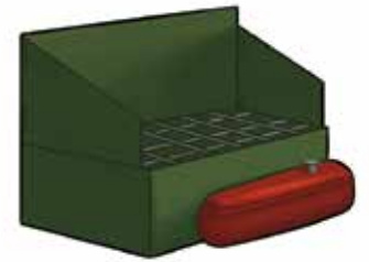
հանրահայտ camping stove