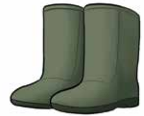
بزلب rubber boots