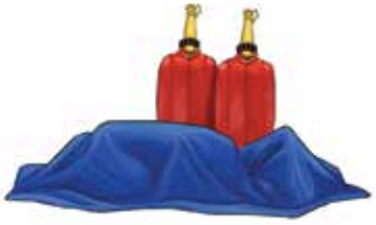
ՀՃ ՆՇԳՆՁՈՒՅ gas cans