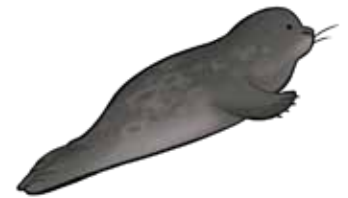
ᓴᓂᓐ ringed seal