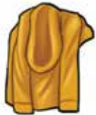
ԼՆԻՇԿԵՅԻՆ rain jacket