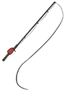
ՃԳԵԵՇՁԵ fishing rod