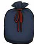
ᓴᓂᓴᓂ sleeping bag