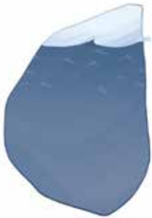
‫בִּזְמָן‬ ice berg