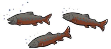
ᐃᓪᓴᓂᓐ Arctic char