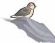
ᄁᄁᄁᄁᄁ snow bunting