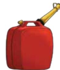
<Δ Ⴄᄁᄁᄁ gas can